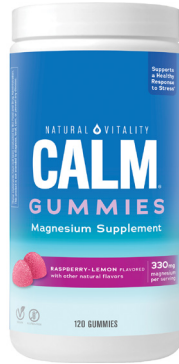
Natural Vitality Calm Gummies selected varieties