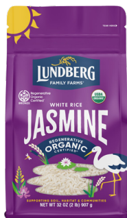
Lundberg Family Farms Organic Rice Pouches selected varieties

Rice-obsessed since 1937. We exist to grow the highest quality rice using organic and regenerative farming practices because the health of our bodies and our planet depend on it.