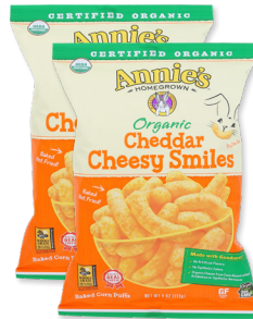
Annie's Organic Cheddar Cheesy Smiles