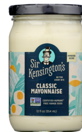
Sir Kensington's Mayonnaise selected varieties