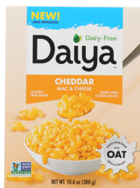
Daiya Deluxe Mac & Cheese selected varieties