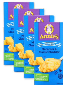
Annie's Mac & Cheese selected varieties