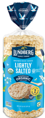
Lundberg Family Farms Organic Rice Cakes selected varieties