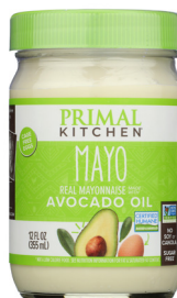
Primal Kitchen Mayo with Avocado Oil selected varieties