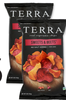
Terra Chips Vegetable Chips selected varieties