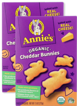
Annie's Organic Bunny Crackers selected varieties

Annie's Promise for Better : a promise to choose nutritious and pantry-worthy ingredients, to add yumminess to every kid's meal, and to use organic ingredients that are forever kind to the planet.